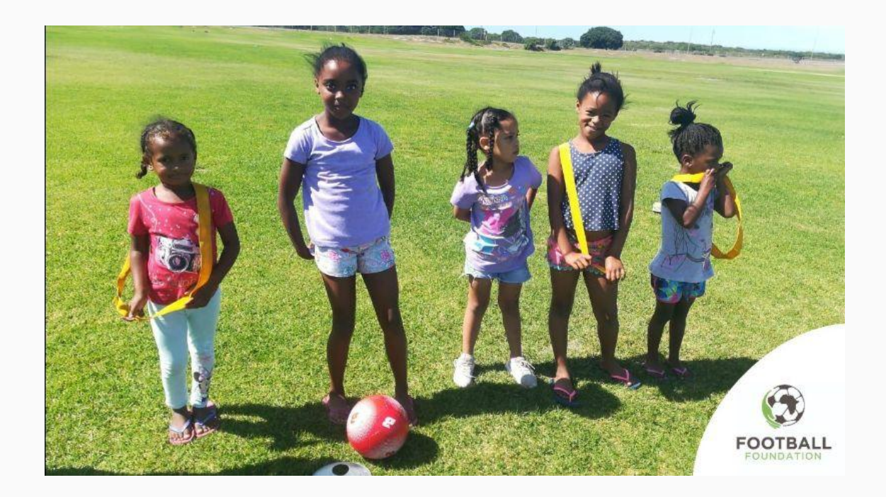
Holiday programme fun: Small groups at Spaces4Sport

The Football Foundation provided a holiday programme at the Spaces4Sport Community field in Gansbaai in the first week of the extended school holiday. At this time when our communities most needed support, our sports coaches offered small group activities including games, health and hygiene activities, and a nutritious daily meal. All programme adjustments were made in accordance with government legislature and recommendations of the World Health Organization in order to contain the spread of Coronavirus and put safety first.